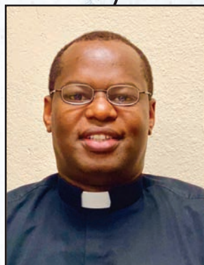
7 th Parochial Vicar of Good Shepherd Catholic Church

"I also find inspiration in a man named Nick Vujicic who has a website entitled 'Life without Limbs.' His message is one of finding joy within God's plan for us. He was born without limbs and has lived an extraordinary life. His example helps us not to fall into a mode of self-pity but rather offer ourselves to God and others as Christ did."