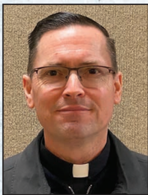
7 th Pastor of Good Shepherd Catholic Church