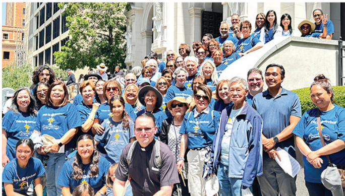
The earliest days of the Eucharistic journey began last May with about 70 Good Shepherd parishioners processing to the Cathedral of the Blessed Sacrament. Almost 20 of these pilgrims continued two months later to Indianapolis connecting with 60,000 pilgrims, all converging from the four corners of the continent.

May 22 | Cathedral of the Blessed Sacrament