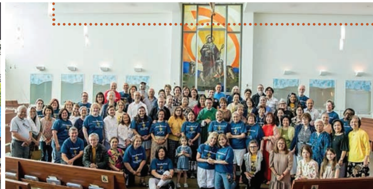
Gathered for daily Mass on July 17, Good Shepherd parishioners joined in solidarity with Eucharistic Congress pilgrims praying that the Holy Spirit would ignite the fire of revival in the hearts of the faithful, to the ends of the earth, for the life of the world.

“Your Christianity is for the world...Our Christianity is not for us. We eat the Body and drink the Blood of Jesus which you have been offered ...for the world.” Bishop Robert Barron, Keynote Eucharistic Congress