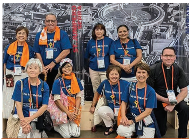
Among some of the first Good Shepherd parishioners to arrive in Indianapolis.