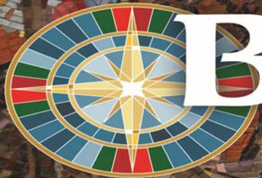
Photo: Mosaic, the Baptism of the Lord, Via Comini, Medjugorje, Bosnia and Herzegovina